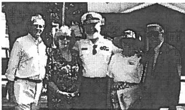
Bateses gather to honor Katharine Lee Bates.