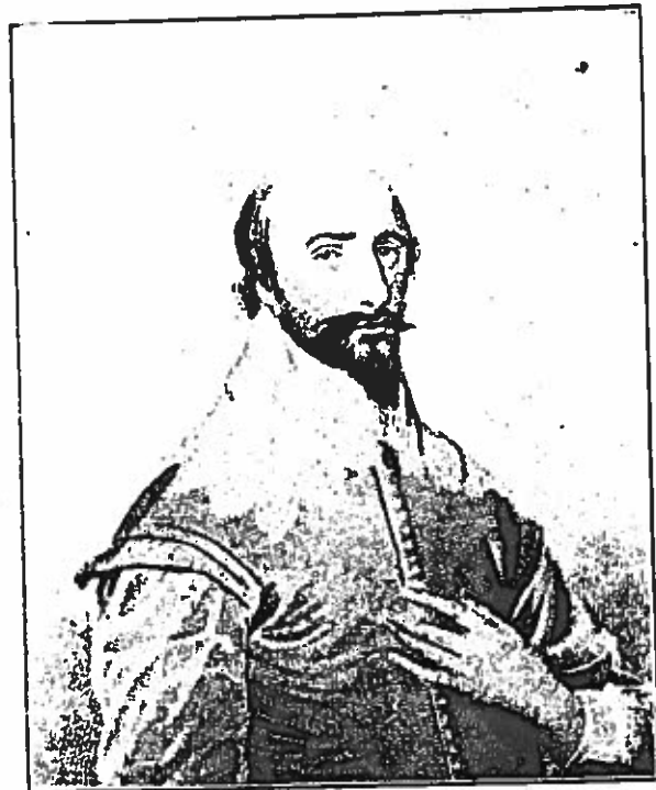
SIR CHARLES BOWLES.