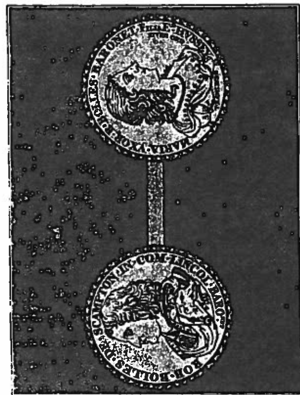
MEDALLIONS BY RAWLINS.