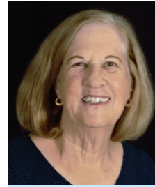
By Jan Alpert, FNGS

Identifying and Building Cousin Relationships: To me ethnicity is just the frosting on the cake. The real value is in each layer of that three layer cake. The top layer is your immediate family, parents, children, grand-