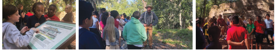
Your contributions assisted The Heritage Library in providing historic tours to students in local schools!

The Heritage Library has produced a video about the RBC Heritage and what it means to our community - COMING SOON!