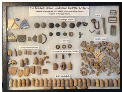
Finds at Fort Mitchell during parking area improvements