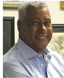
By Ezra Callahan

have made us think outside the box and take advantage of grant and loan programs made available because of the pandemic. We continue to operate in the positive and are always looking at ways to grow our income so that we can grow programs and projects. We are grateful to all our donors and members. Our goal is to ensure that your contributions are used prudently.