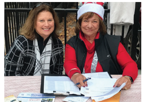
WAAHI members check-in guests at Historic Holidays