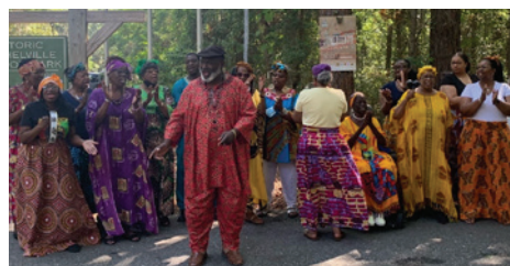
The sweet sound of music and song was heard throughout the day.