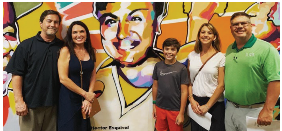
The Esquivel Family