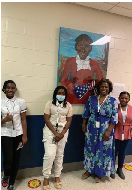
Celebrating Harriett Tubman