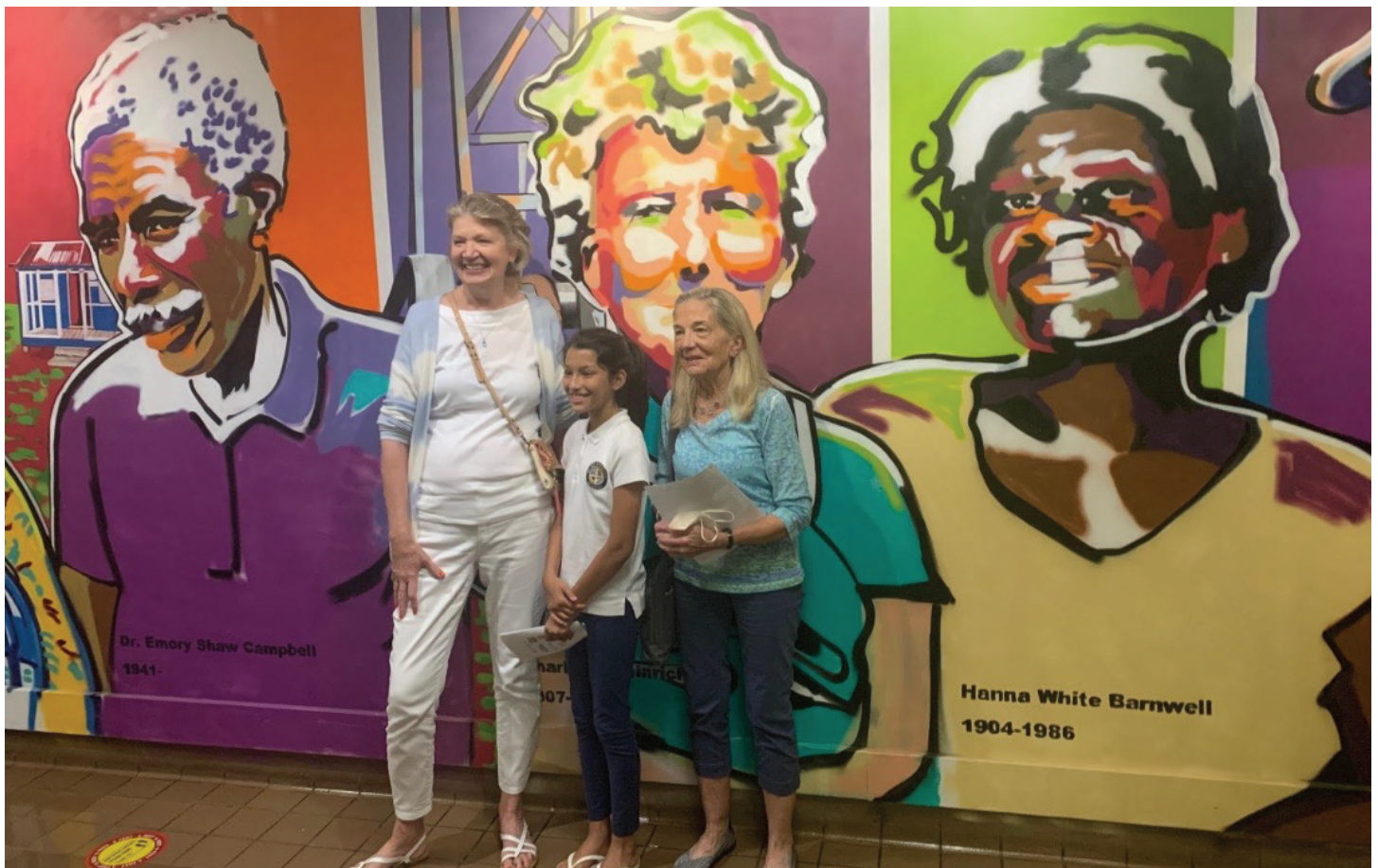
Artist and students celebrate local legends

The project was underwritten by the Town's Office of Cultural Affairs as one of its Community Creates Initiatives. The purpose of the project