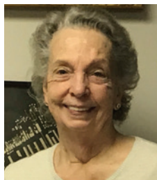
By Sunni Bond Contributor

There are several online courses offered through the U.S. Census Bureau that may be helpful in your genealogical research. Check out census.gov/academy for these courses.