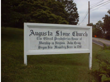
AUGUSTA STONE CHURCH