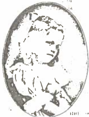
Marilla Converse Cudworth.