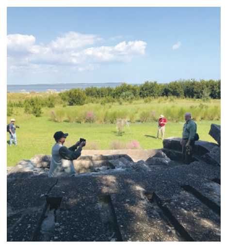
CDSG member takes a photograph of the Steam Gun

After the tour and lunch, the group was taken to Port Royal Plantation to