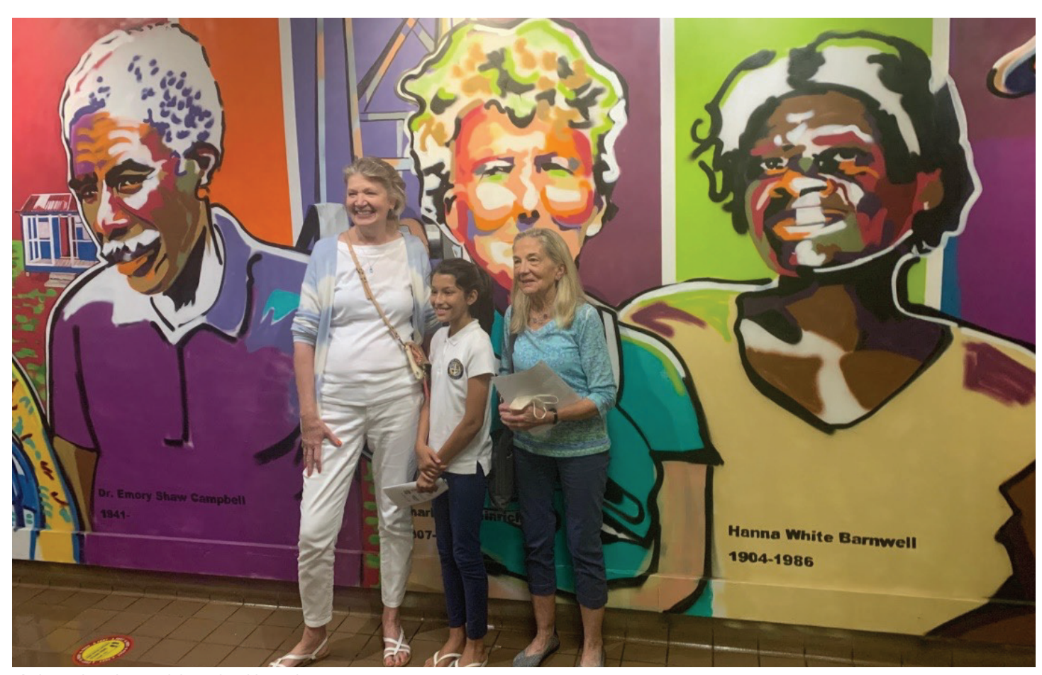
Artist and students celebrate local legends

The project was underwritten by the Town's Office of Cultural Affairs as one of its Community Creates Initiatives. The purpose of the project