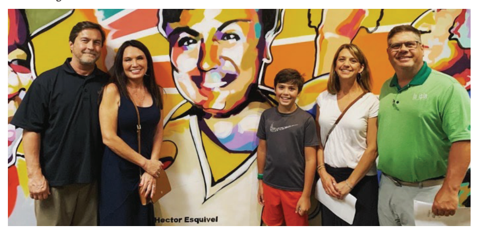
The Esquivel Family