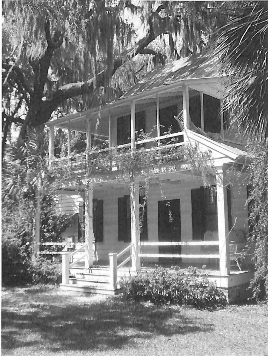
Card House, Bluffton, SC