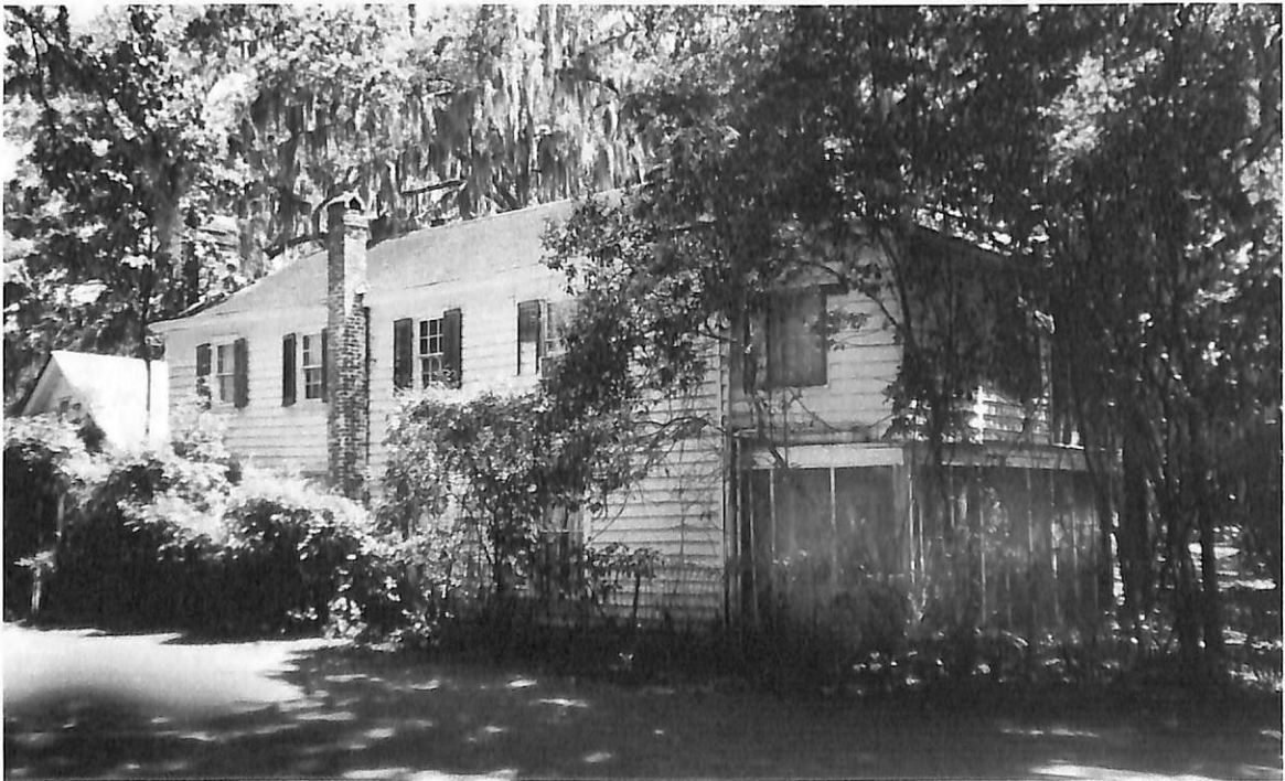
Squire Pope's carriage house which now sits at 111 Calhoun Street, Bluffton, SC